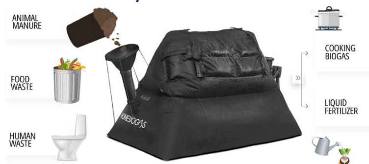
Figure 1: Feed and output of HomeBioGas systems

The company is active in 3 segments- 1) Biogas systems for domestic use/ small farms, 2) domestic / off-grid sanitation, and 3) institutional kitchens.