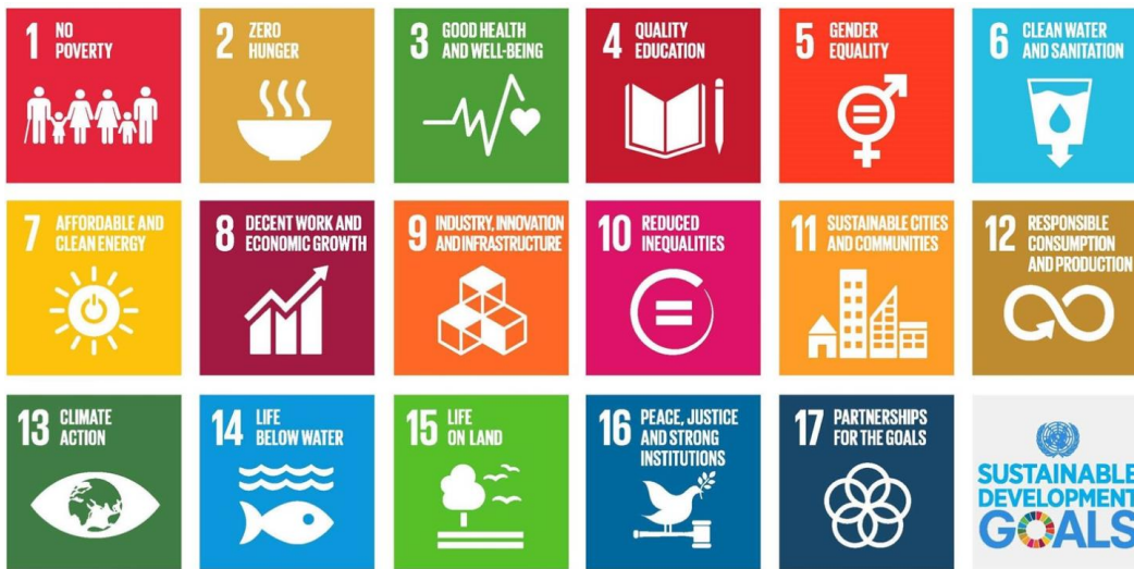
Figure 5: The 17 United Nations Sustainable Development Goals (SDG's)

HomeBiogas has a strong value proposition matching with 8 of the 17 UN goals, making it attractive and highly-relevant to commercial companies, organizations, banks, and governments.