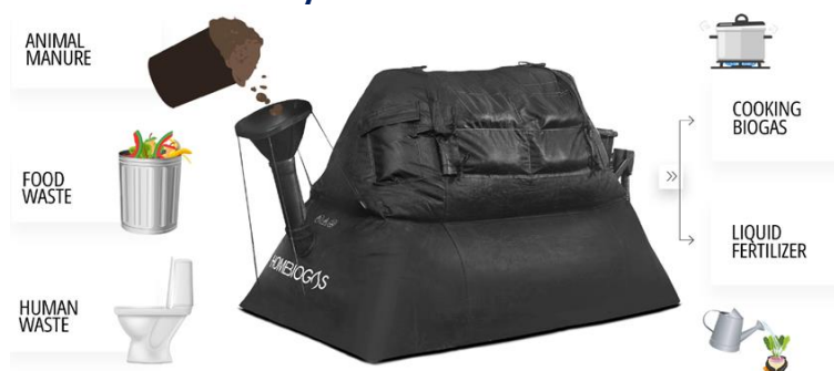
Figure 1: Feed and output of HomeBioGas systems

The company is active in 3 segments- 1) Biogas systems for domestic use/ small farms, 2) domestic / off-grid sanitation, and 3) institutional kitchens.